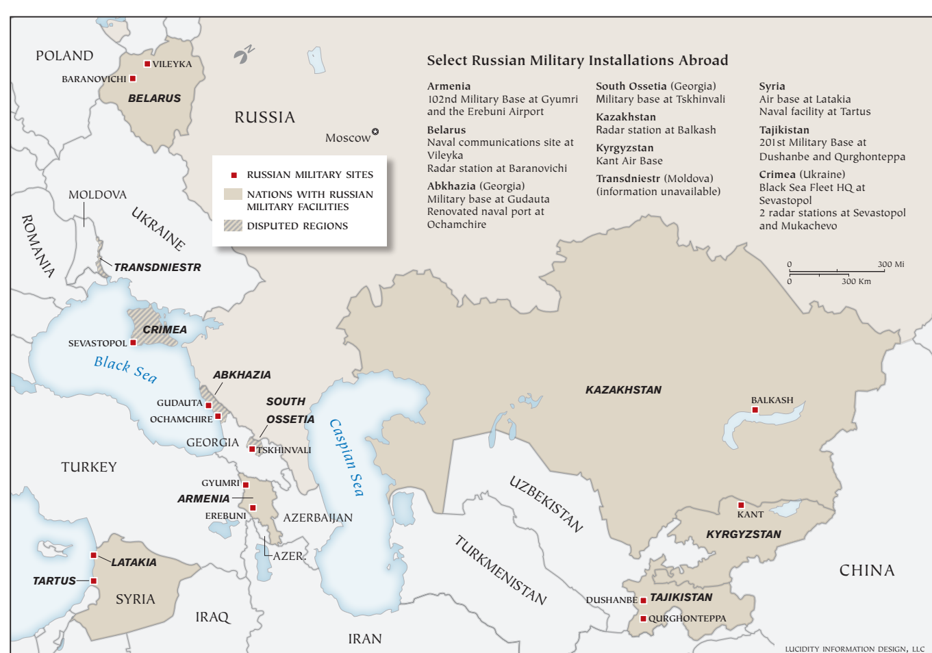
Figure 1. Select Russian Military Installations Abroad

In Syria, Libya, and Egypt, Russia has demonstrated its rejuvenated military muscle, diplomatic agility, ability to muster considerable resources in support of its policy, and a near-total lack of scruples in pursuit of its strategic objectives. Elsewhere in the region, Moscow has mounted diplomatic offensives aimed at Iraq, Kuwait, Qatar, Saudi Arabia, and the United Arab Emirates.<sup>50</sup> The Kremlin has employed a variety of means, including visits by senior officials, energy diplomacy, the pursuit of trade and economic ties and investment opportunities, arms sales, and civilian nuclear energy projects to expand Russian influence and presence, signaling that Russia is returning to the Middle East as a major power and plans to stay for the long run. (Figure 1 offers a sense of Russia's expanded security presence in the Middle East, the Black Sea, and nearby former Soviet states.)