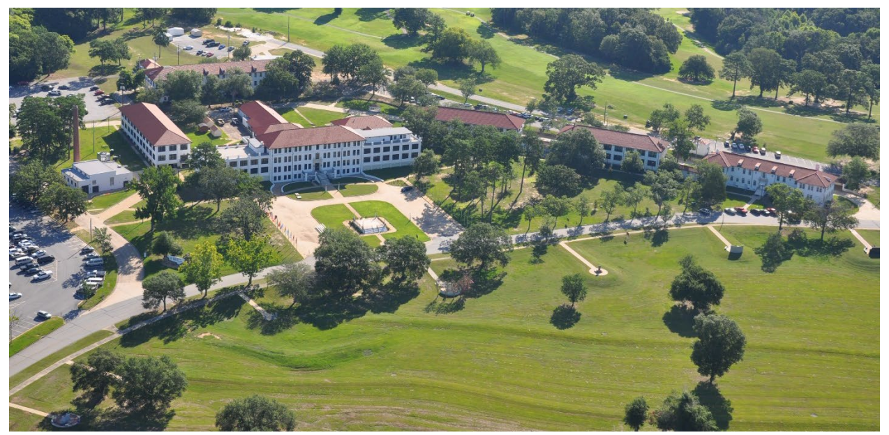
A. <u>Mission</u>: Train, educate and develop ethical leaders to strengthen democratic partnerships in the Western Hemisphere.

II. OVERVIEW WHINSEC, located on Fort Moore, GA, provides professional military education and training to eligible U.S. and Partner Nation personnel. Since 2001, WHINSEC has championed human rights and democracy by developing a new generation of ethical leaders to confront the Western Hemisphere's uncertain and complex security challenges. WHINSEC's professional education and training offerings promote innovative critical thinking grounded in U.S. doctrine and respect for human rights, the rule of law, and due process. It encompasses education at all levels, from tactical training to advanced theory on defense doctrine application in national and regionally accredited graduate-level master's degree programs. For over 20 years, WHINSEC has been a premier professional military education and training Institution, typically graduating approximately 1,000 military, police, and civilian students from across the Western Hemisphere annually.