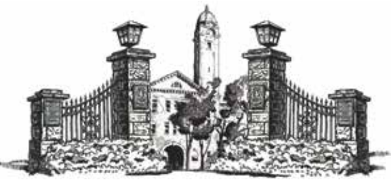
The Best Hometown In The Army