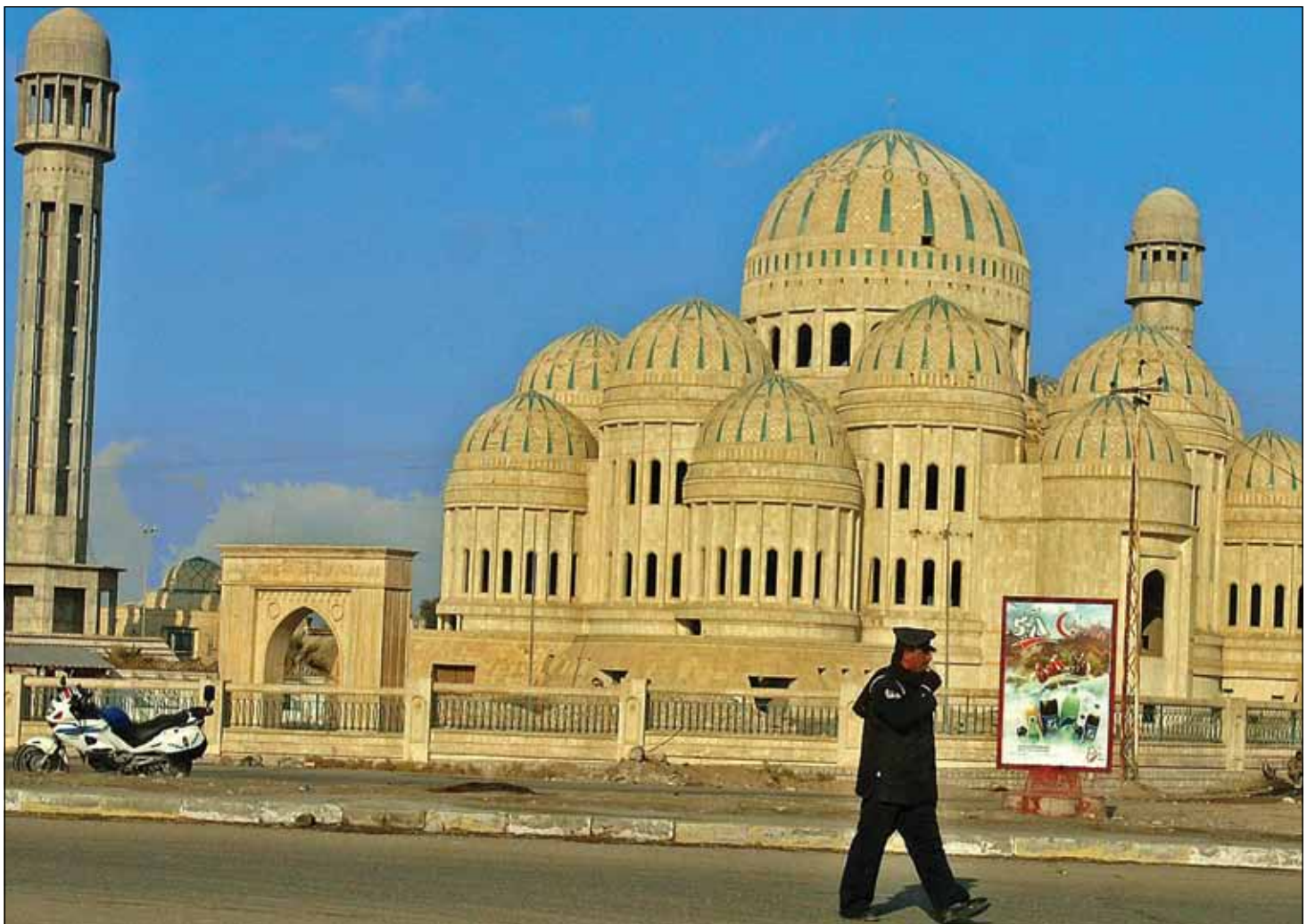
An Iraqi policeman walks before the Mosul Mosque, located in downtown Mosul, which is the largest mosque in this city of roughly 1.7 million residents. In a city of historic mosques, temples and cathedrals, the Mosul Mosque is relatively new, originally planned and founded by Saddam Hussein; the building is not yet completely finished.

The current situation in Iraq, Afghanistan, Chechnya, Somalia and other places are ironically helping the radical Islamist groups to recruit new members justifying that it's a "war against Muslims."