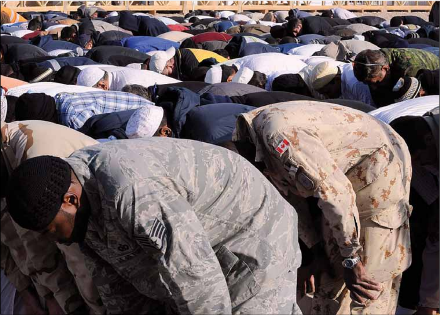
Hundreds of Muslims pray together during an Eid al-Adha worship service at Kandahar Air Field, Afghanistan, Nov. 16. Eid al-Adha marks the end of Hajj, an annual religious pilgrimage to Mecca, Saudi Arabia.

ideology, 4) politicization of Islam, 5) the modernization of Islam, 6) activation of Islamic factor in international relations, and the role of the Western cultural influence.