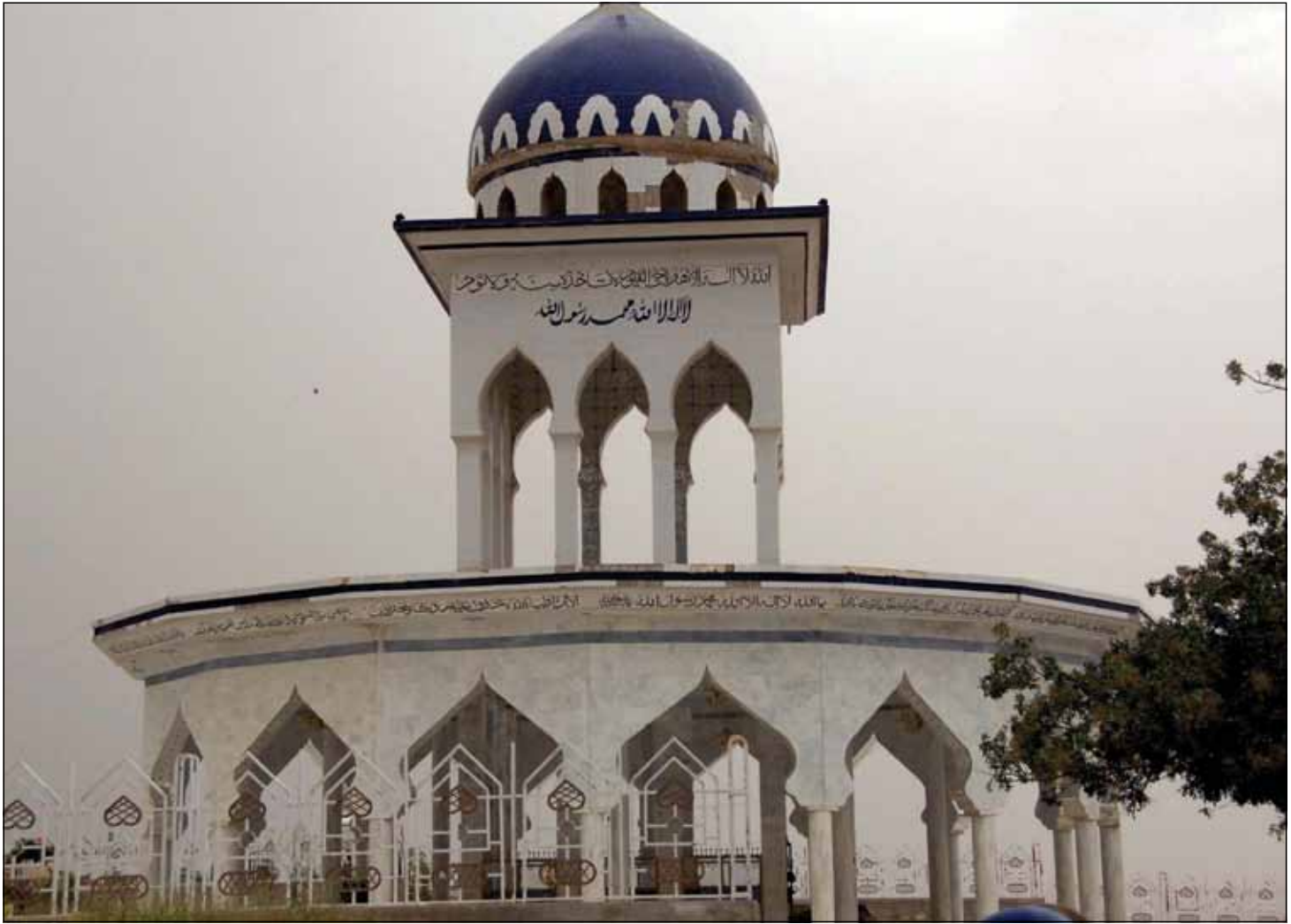
The Blue Mosque in Khakrez, Afghanistan. Villagers and many Afghan families visit this well known Mosque to say prayers.

The hearts and minds of all Muslims must be won. It is only by doing so that the West will be able to prevent the spread of militant Islam. If Muslims should become equal members of the Multicultural Western societies, the militant concept of “Western conspiracy” against Muslim societies would lose its ground.