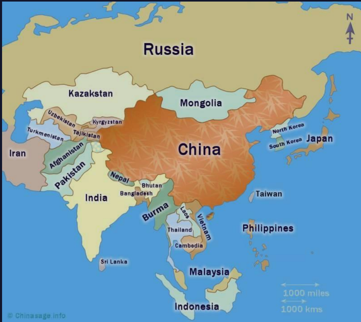
Map Credit: Chinasage.info